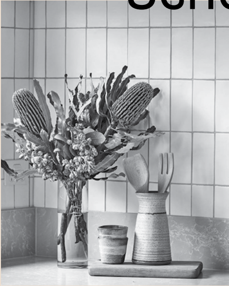
2019 Course Guide Melbourne