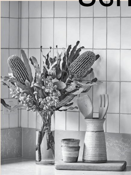
2018 Course Guide Melbourne